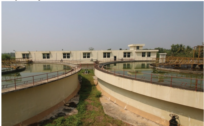
Completed water treatment plant remaining unutilised

The existing drinking water supply facility in Alappuzha Municipal Town maintained by KWA was inadequate and unsafe due to high concentration of chloride, fluoride and iron. Fifty five per cent of the school children were affected by dental fluorosis and the district was declared as endemic area of fluoride menace. In order to mitigate the drinking water problem, the Municipality had drawn up (March 2007) a DPR with an outlay of ₹91.94 crore and SLSC approved the DPR in March 2007 stipulating the period of completion as two years. The project consisted of six packages which were intended to be implemented on war footing.