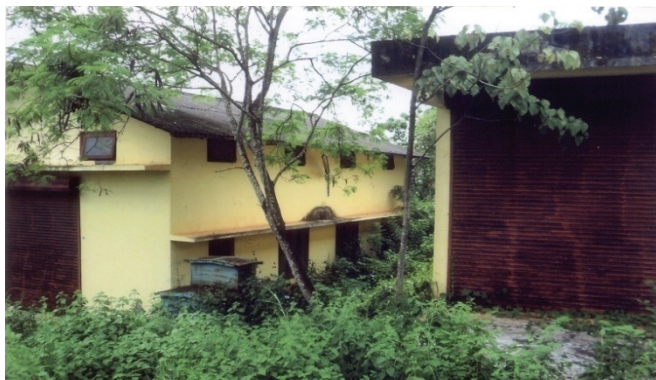
Building of Apparel Park in dilapidated condition

The municipality purchased (March 2006) machinery such as garment printing machine, offset printing machine, high speed overlock machine, automatic button sewing machine, steam ironing system, etc., and 7.5 KVA Generator at a cost of ₹15.78 lakh and installed them in the newly constructed building of women industrial estate. Construction of office building, work sheds and water tank was also completed at a cost of