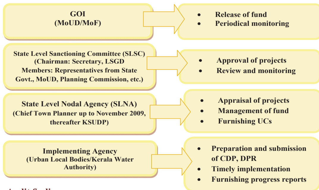
Chart 4.1: Organisational structure