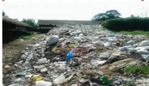
Waste heap at proposed SWM Plant site

Changanacherry Municipality made a provision of ₹6.53 lakh in the DPR for removal of about 1000 tons of accumulated waste (as of 2007) at the processing yard to facilitate the establishment of the treatment plant. The Municipality entrusted the work of the